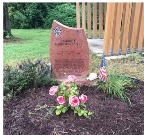
Pictured above is a memorial for Harriet Robinson Scott, who with her husband Dred Scott, sued for freedom from slavery.