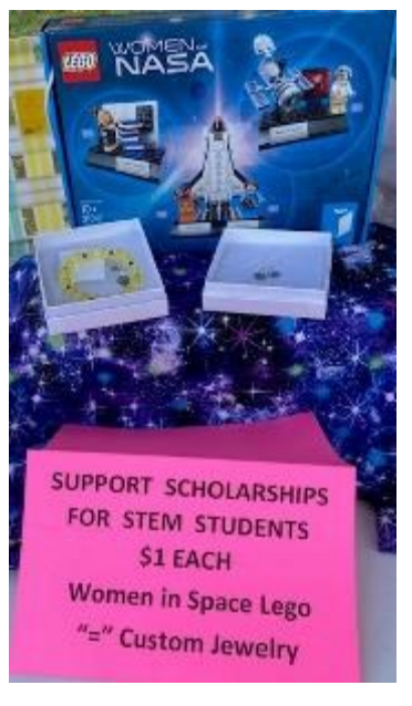
Raffle items were eye-catching

A number of people signed up to receive further information on AAUW and our branch. Thanks to all who made it a successful weekend in spite of heat and sudden downpours!