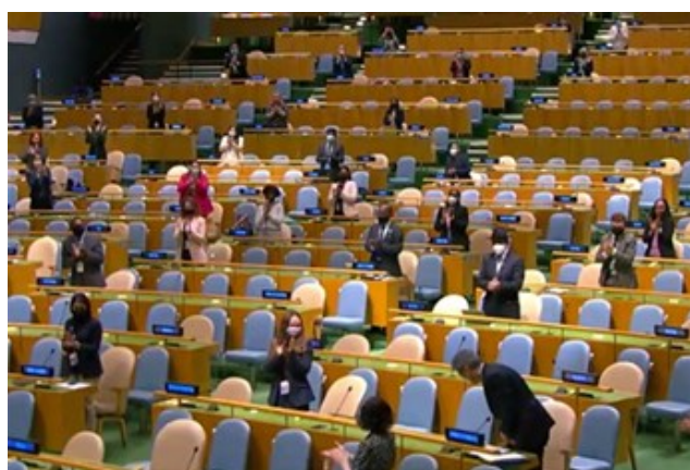
Scene from the General Assembly Hall during the closing session of the 65th session of CSW.

Recognizing women's important role as agents of change in responding to climate change, the agreement also stresses the need to reinforce women's presence and leadership in all places where decisions on climate change mitigation and adaptation are taken, and to ensure that related policies, plans, and programs account for the specific needs of women and girls.